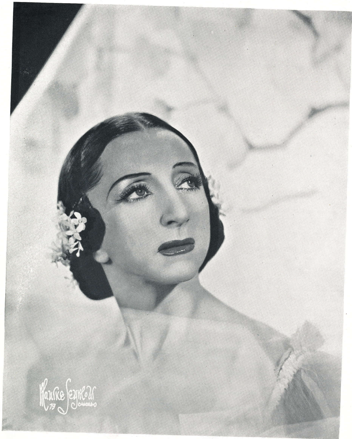
Guest Artist: ALEXANDRA DANILOVA